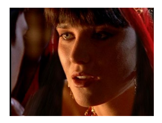
CONQUEROR XENA (in a playful tone that has a hint of a threat): You're not saying no to me, are you?

She kisses him again, clutching at his vest and pulling him up to his feet. This time, it's a long, hard, passionate kiss that makes him moan and shudder. Conqueror Xena lifts her hands, clutching at the back of Ares' head; he draws his arms around her waist, pulling her closer.