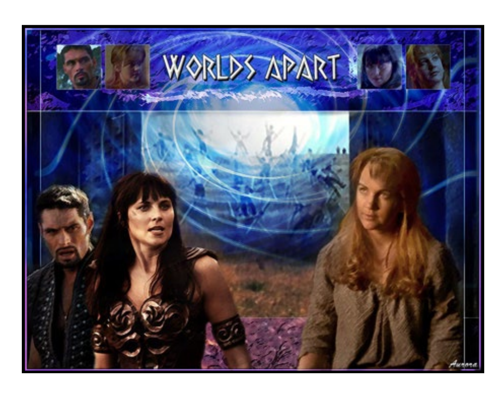
Production #XWP198/SS64 Episode #9.17

Story By: LadyKate and Sais 2 Cool Written By: LadyKate and Sais 2 Cool with Aurora Collage By: Aurora Images Gathered By: Aurora