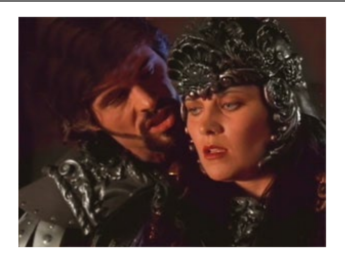
ARES (in a soft, suave voice): Welcome home, Xena. Welcome home.

The camera pulls back and pans to Xena, Gabrielle, Ares and Eve. Gabrielle is staring at the portal horrified; Ares is looking down; Eve has dropped her head into her hands. Xena looks dazed.