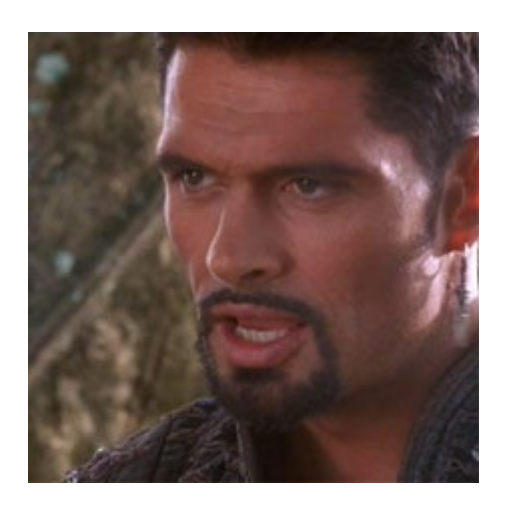
ARES (steps back and eyes them warily): Exactly what do you mean by that?

No. To tell you that after everything you did for us, we thought it was time we did something for you.